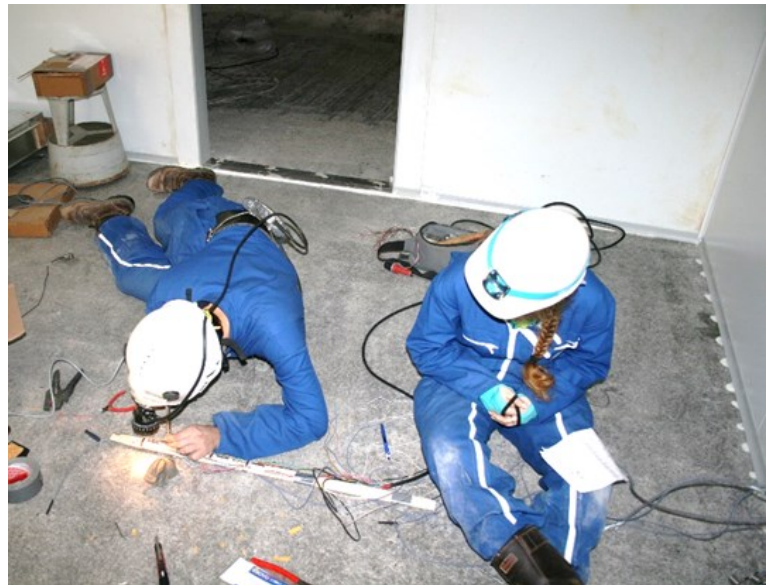
Installation of the ultrasonic passive and active sensors inside the salt rock mass under the experimental cooling chamber

Results support the theoretical mechanical concept (Sicsic et Bérest 2014) where only the major cracks (figure below) are selected. The first cooling phase governs